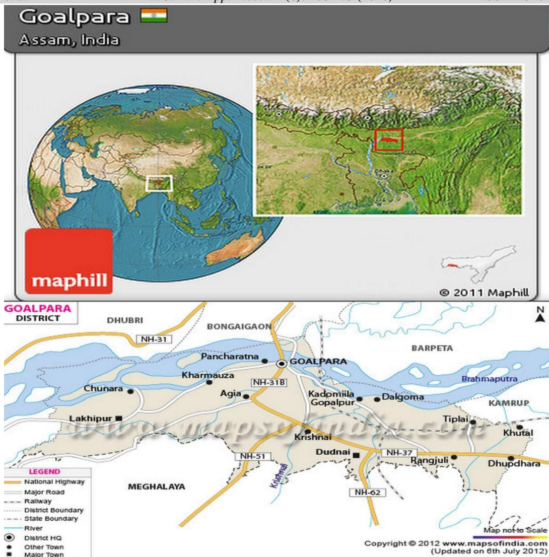
Fig. 1: Map of Goalpara district, Assam, India